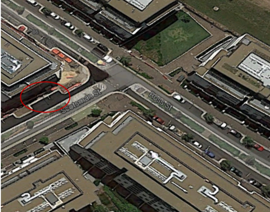
Proposal Proposed Car Share Scotsman Street, Forest Lodge